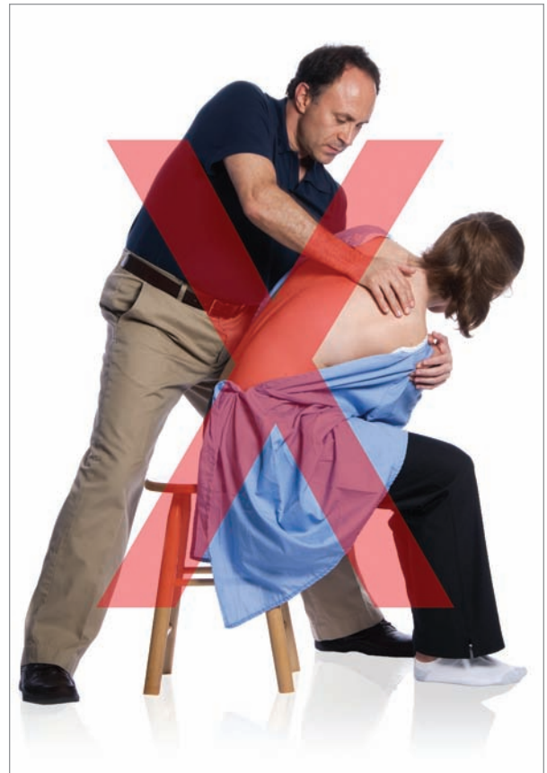
FIGURE 2: Incorrect initial position for joint mobilization of the thoracic region. The therapist is bending and rotating the client from the lumbar region.