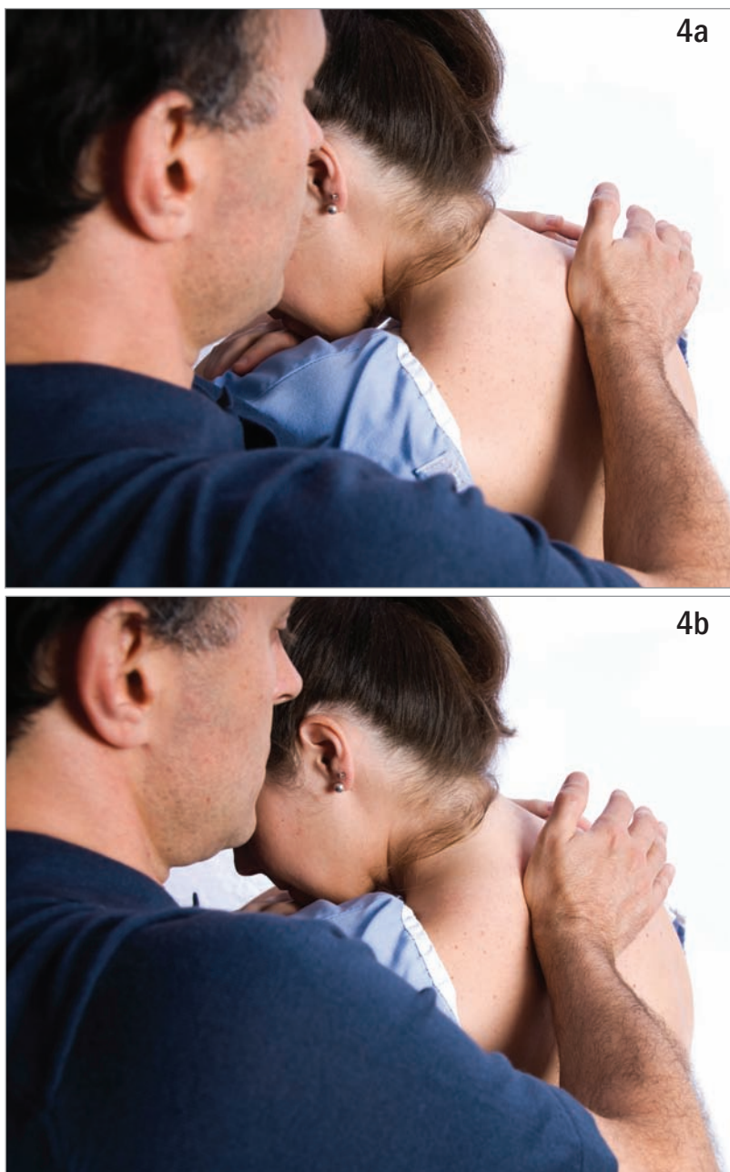
FIGURE 4: Two contacts of the thenar eminence of the treatment hand are shown. In a, the therapist applies the joint mobilization force to the angle of a right rib. In b, the therapist applies the joint mobilization force directly to the left side of the base of the vertebral spinous process.

thereby adding to the flexion and rotation force as the treating hand applies the mobilization force to the client's back. This mobilization stretch is applied for only a second or less and is usually repeated two to four times. The therapist can then move the treating hand to the next level of the rib cage or spine to be mobilized. After mobilizing all twelve levels of the thoracic region, the other side can be mobilized.