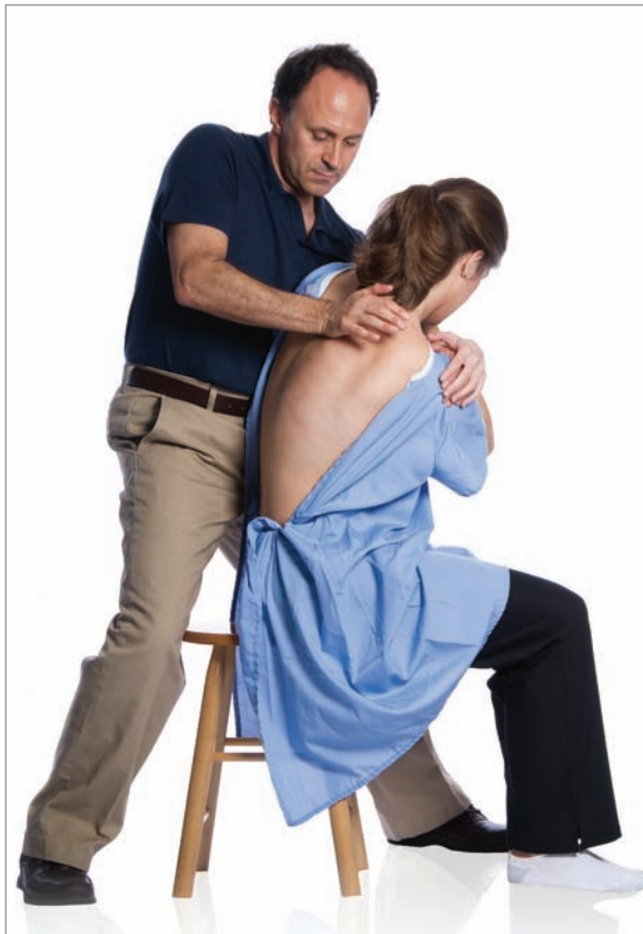
FIGURE 1: Initial position for joint mobilization of the thoracic region. The therapist's left hand is supporting the client and bringing her upper and middle back into flexion and left rotation to create tension in the client's thoracic region.