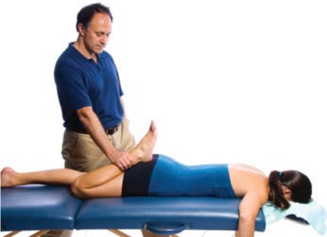
FIGURE 5. NACHLAS TEST. THE CLIENT'S HEEL IS PASSIVELY BROUGHT TO THE SAME-SIDE BUTTOCK.