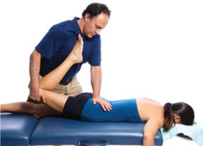
FIGURE 6. YEOMAN'S TEST. THE CLIENT'S THIGH IS PASSIVELY LIFTED INTO EXTENSION AS PRESSURE IS PLACED UPON THE SAME-SIDE POSTERIOR SUPERIOR ILIAC SPINE (PSIS).