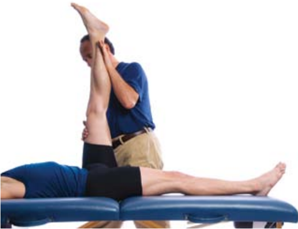
FIGURE 4. PASSIVE STRAIGHT LEG RAISE. THE CLIENT'S THIGH IS FLEXED WITH THE KNEE JOINT FULLY EXTENDED.