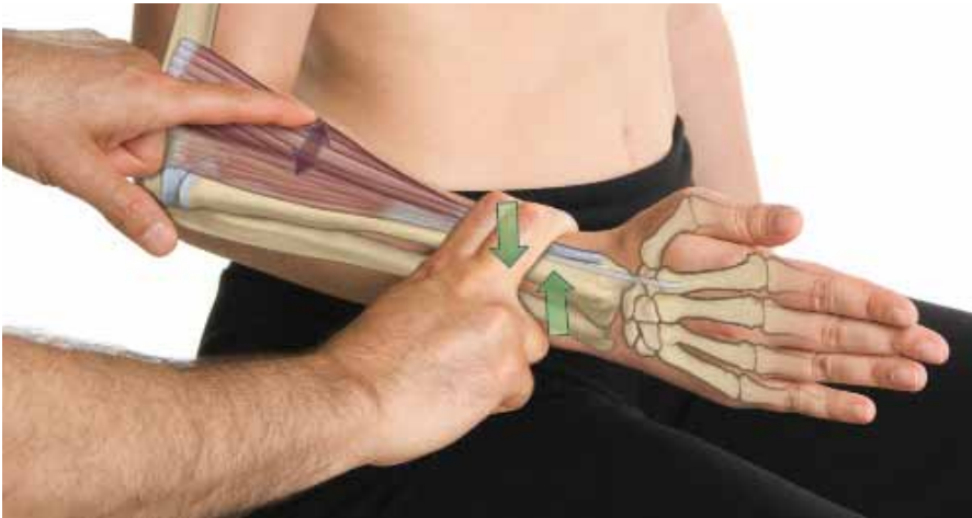
Above. Figure 6