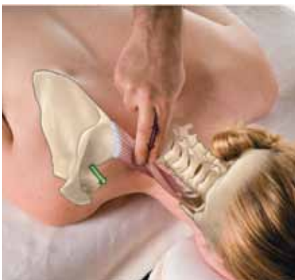
Above. Figure 2