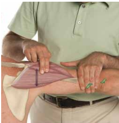
Above. Figure 3b

Dorsiflexion engages the EDL but not the FL (the FL everts and plantarflexes the foot). If we had asked the client to evert in this case, both the EDL and the FL would have contracted, making it difficult to discern the border between them.