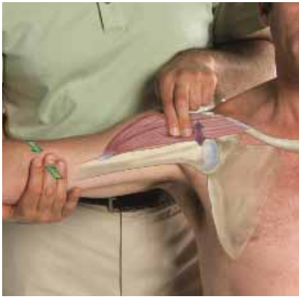
Above. Figure 3a.