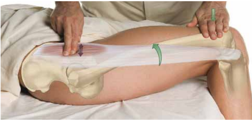
Above. Figure 7