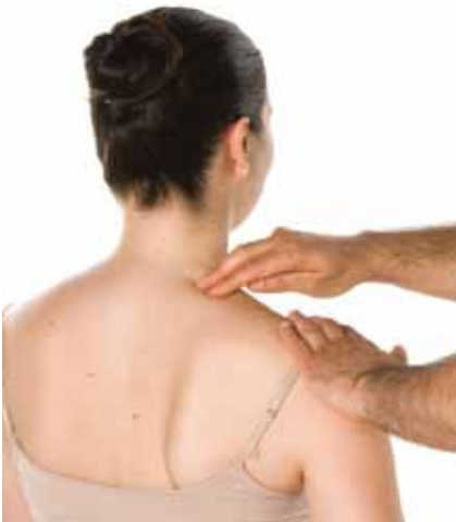
Above. Figure 1

In other words, we must clearly discern the target muscle from all other tissues. This means that we need to find an action that