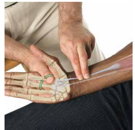
Above. Figure 4.

The art of muscle palpation involves the quality of our touch as we seamlessly weave together these guidelines - guidelines that