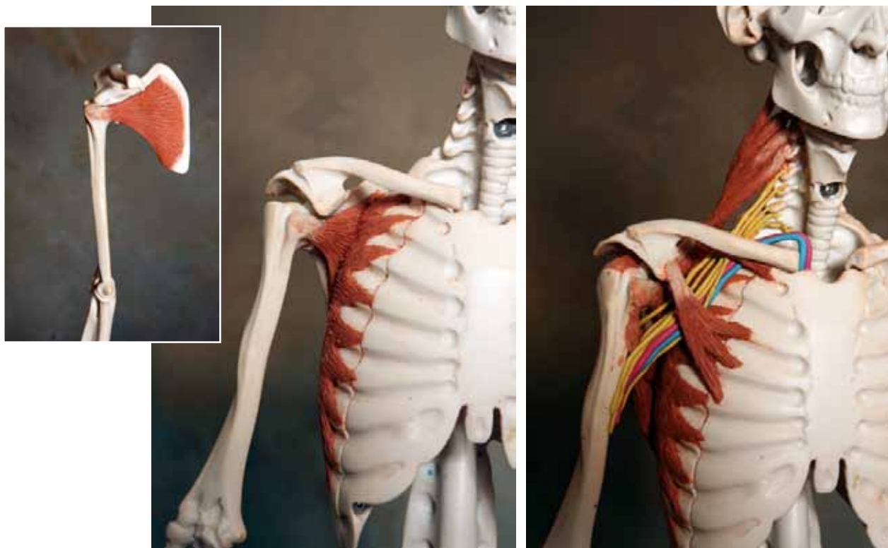
PHOTOS OF MANIKEN® WITH FULL PERMISSION BY AND ATTRIBUTION TO JON ZAHOUREK

A more direct and creative kinesthetic approach for learning muscles is to actually design and create them in